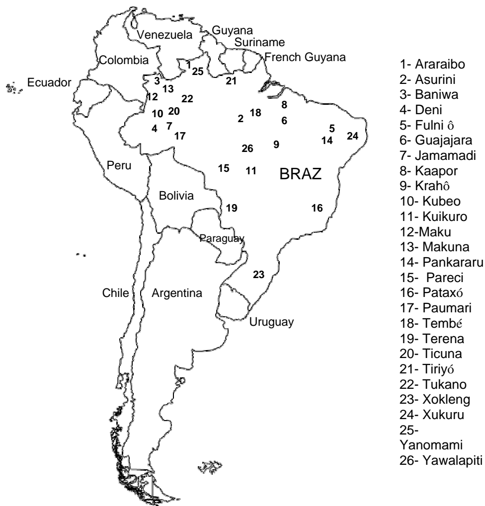
Figure 1: Map of South America showing the geographic location on Brazilian territory of each one of the 26 indigenous ethnic groups analyzed in this study ( apud Brock University Map Library [482] ). 1- Araraibo, 2- Asurini, 3- Baniwa, 4- Deni, 5- Fulni ô, 6- Guajajara, 7- Jamamadi, 8- Kaapor, 9- Krahô, 10- Kubeo, 11- Kuikuro, 12- Maku, 13- Makuna, 14- Pankararu, 15- Pataxó, 16- Pareci, 17- Paumari, 18- Tembê, 19- Terena, 20- Ticuna, 21- Tiriyo, 22- Tukano, 23- Xokleng, 24- Xukuru, 25- Yanomami, and 26- Yawalapiti.